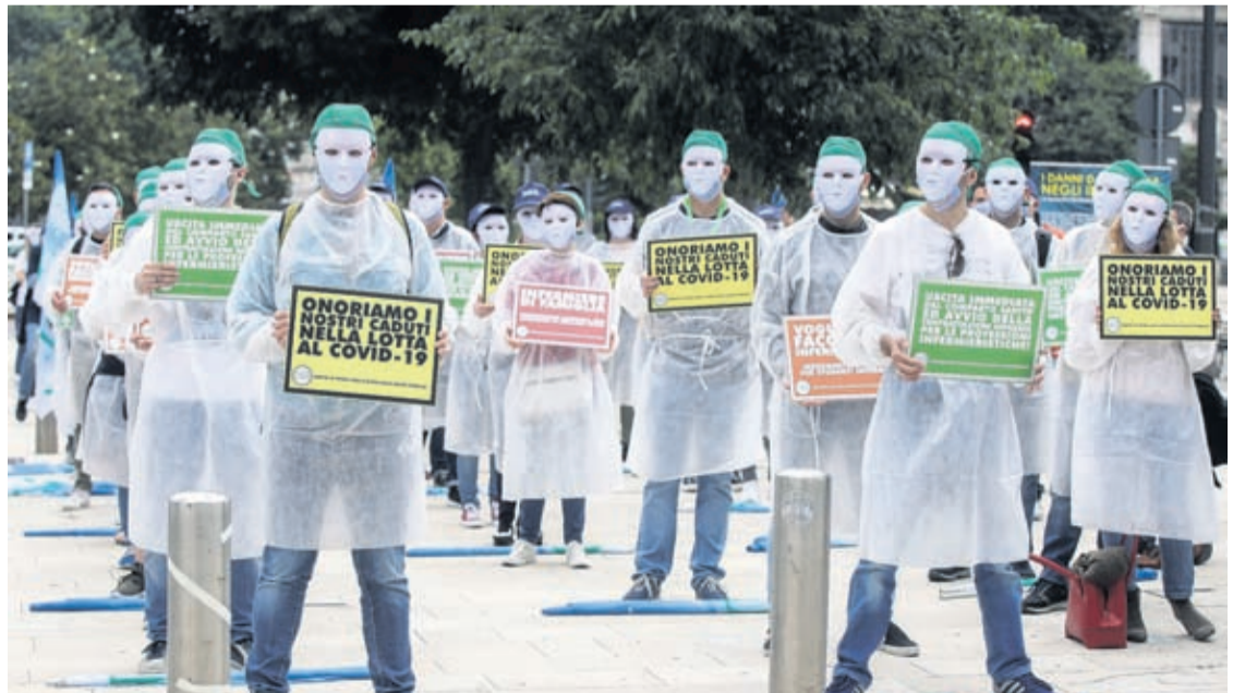
Nurses belonging to NurSind union hold up signs with writing reading in Italian "We honor our fallen in the fight against COVID-19" as they stage a protest in front of the Pirelli skyscraper hosting the Lombardy Region headquarters, in Milan, Italy, Wednesday, June 10, 2020.

tine upon arrival. Greece, another European holiday hot spot, will allow tourists to fly to Athens or the main northern city of Thessaloniki beginning on June 15. But that's hoping people have money to spend. The Organization for Economic Cooperation and Development said Wednesday that global economic output could fall by as much as 7.6% this year if a second wave of infections emerges, with the pandemic's economic impact expected to be even harsher in Europe because of the continent's strict and relatively lengthy coronavirus lockdowns.